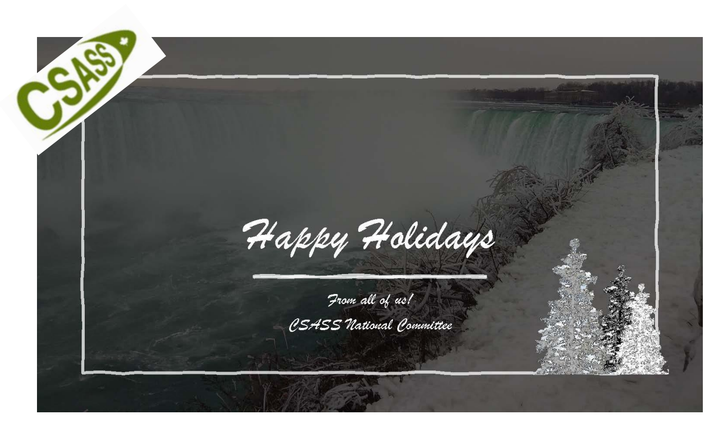
"O, Wind. If Winter comes, can Spring be far behind?" - Percy Bysshe Shelley